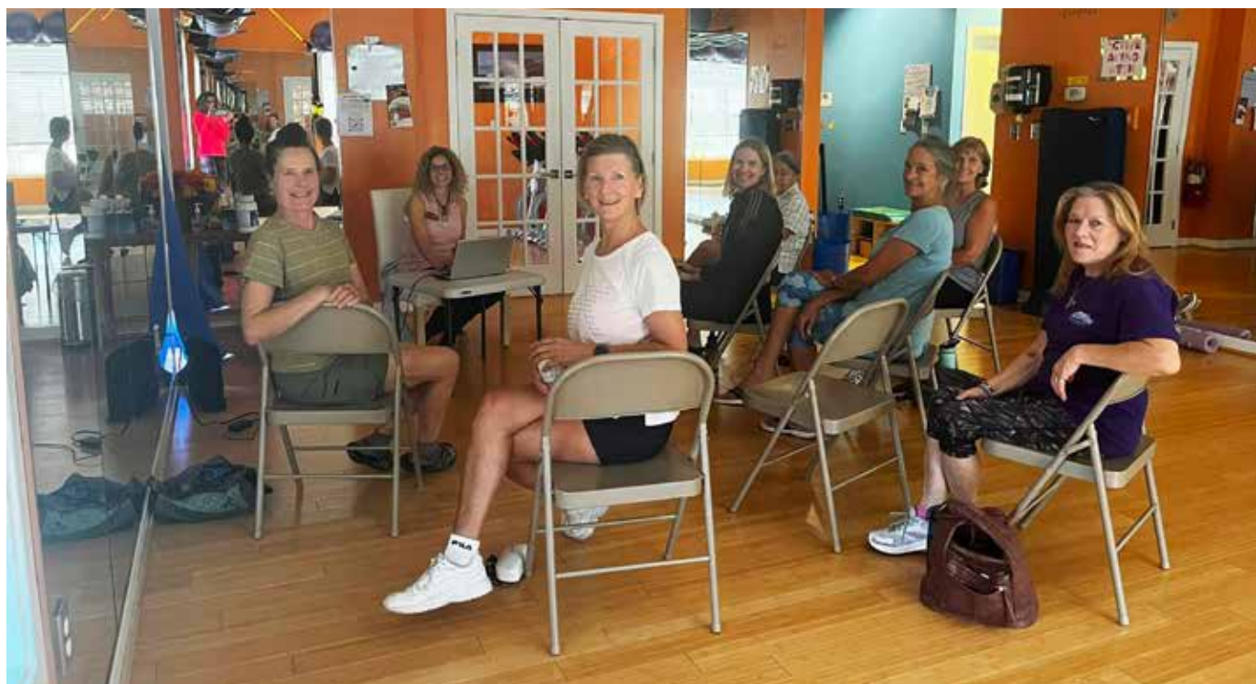
The Fit in Boonsboro fitness center in Boonsboro, Maryland, hosted a local nutrition specialist as part of its activities to celebrate Active Aging Week 2023. The presentation highlighted information about The Blue Zones and the impact of nutrition on health for attendees.

host and/or have staff and volunteers to lend their support, consider activities to address each dimension of wellness—ICAA endorses seven (physical, spiritual, social, emotional, intellectual, vocational and environmental). Some organizers schedule multiple activities to take place every day.