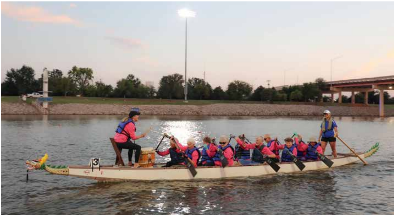
Showing their Active Aging Week spirit, Spanish Cove's dragon boat paddlers raced in the 2023 Oklahoma Regatta Festival, held on the Oklahoma River. The community boasts two competitive teams, the Silver Dragons and the Golden Dragons.

in wellness programming. Individuals experience the camaraderie of shared fun, goodwill and adventure.