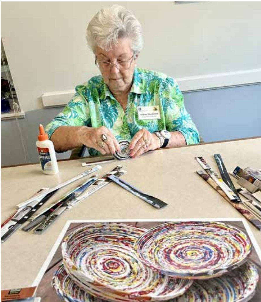
At Heisinger Bluffs in Jefferson City, Missouri, Active Aging Week included making bowls with recycled magazine pages for 'Go Green for Health.'

for Active Aging Week “to tap into creativity to age well.” While activities took place daily, one that got people moving was a silent disco party, where participants danced to the music playing in their wireless headphones.