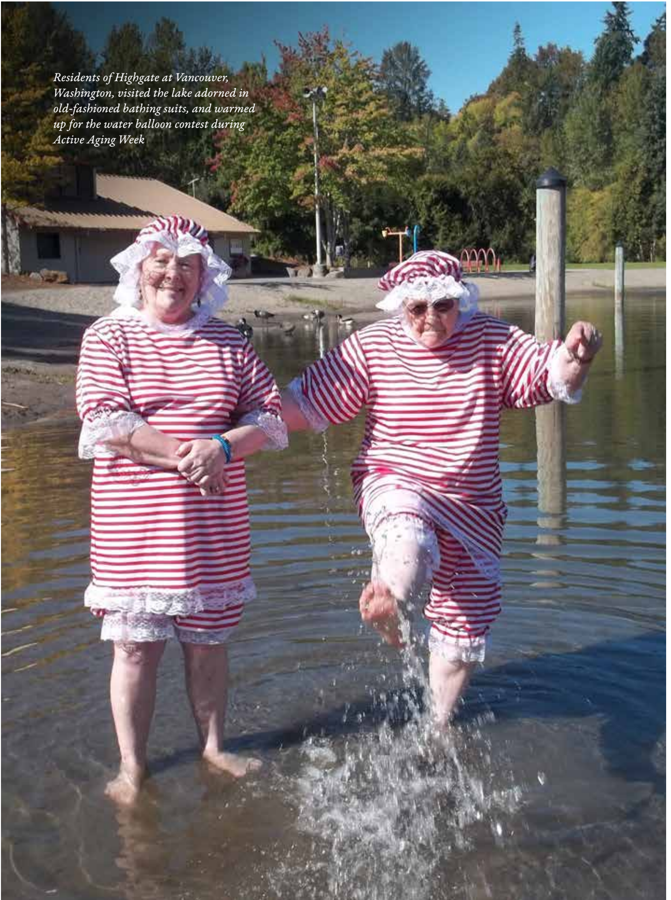
Residents of Highgate at Vancouver, Washington, visited the lake adorned in old-fashioned bathing suits, and warmed up for the water balloon contest during Active Aging Week